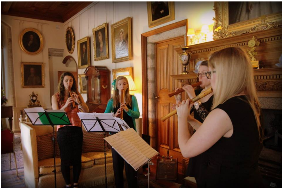
Palisander in Drum Castle, Scotland