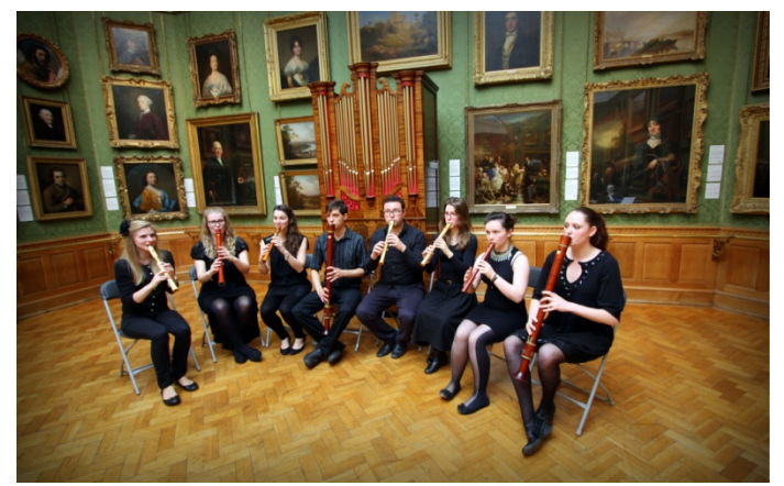
Woodwork in Aberdeen Art Gallery

Post-degree life can be a worry for any student; maintaining contacts and skills whilst seeking work and developing a career is a tough juggling act. This is one of the reasons why the Guildhall School Recorder department established a flagship ensemble, Woodwork , a group made up of current students and alumni. This ensemble, unique in the UK, allows young professionals who have left the Guildhall School to continue to develop skills in large ensemble work whilst providing a mentoring role to students.