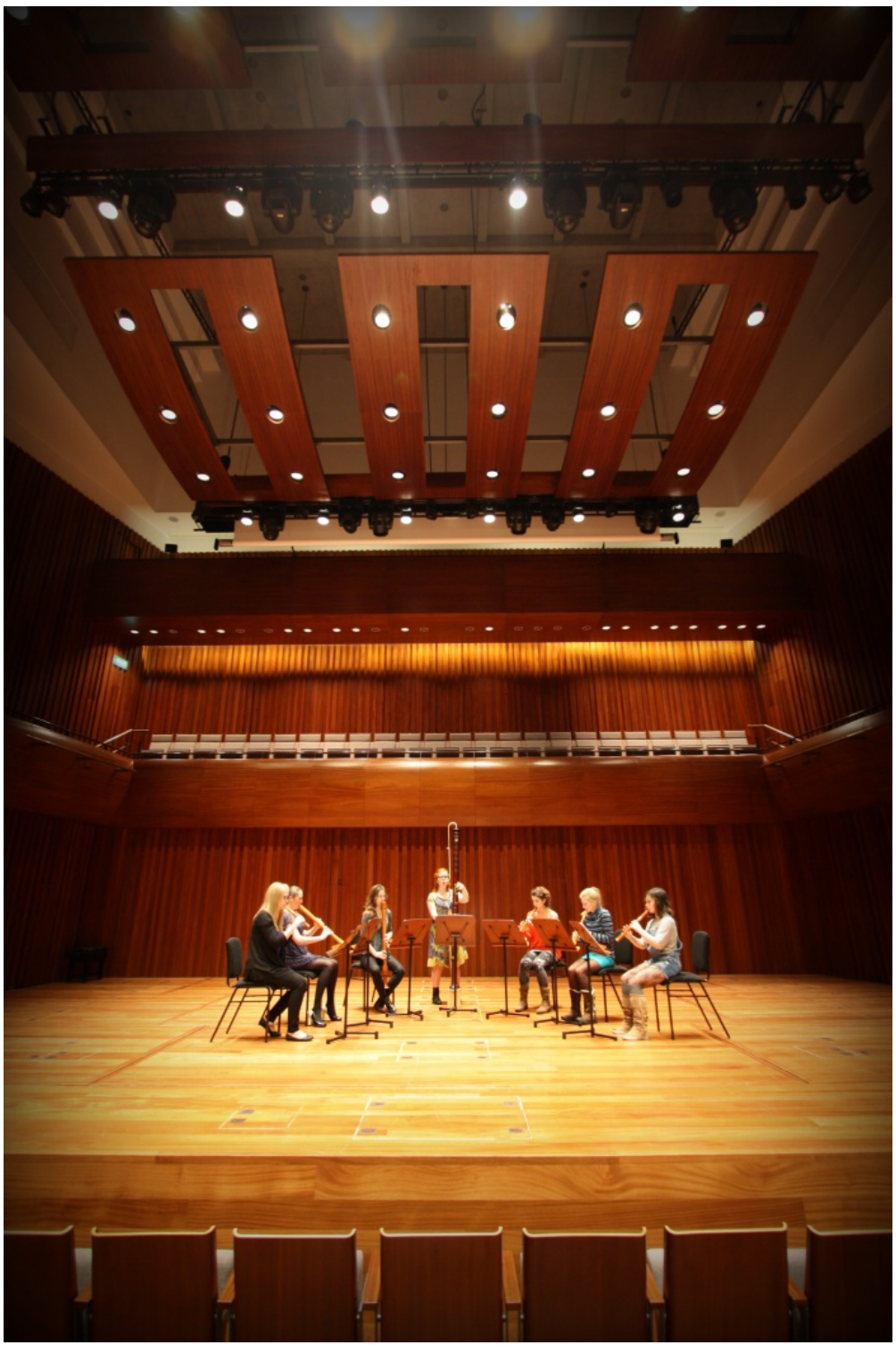
Woodwork in Milton Court