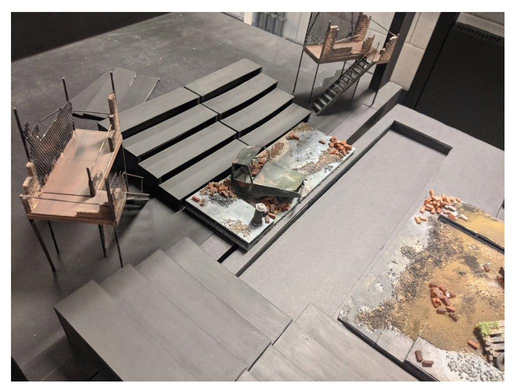
The Angel Esmeralda Licensing Pack – Chloe Stally-Gibson Page 3 of 6