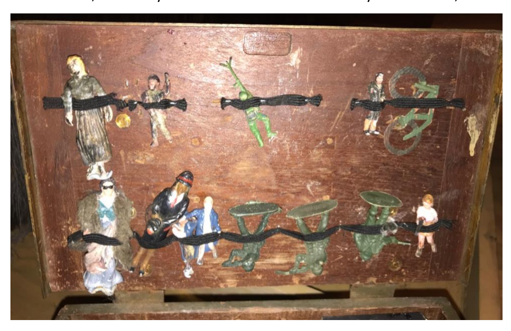
(Scene 7) Beatriz in fur coat, Jozka, boy, girl