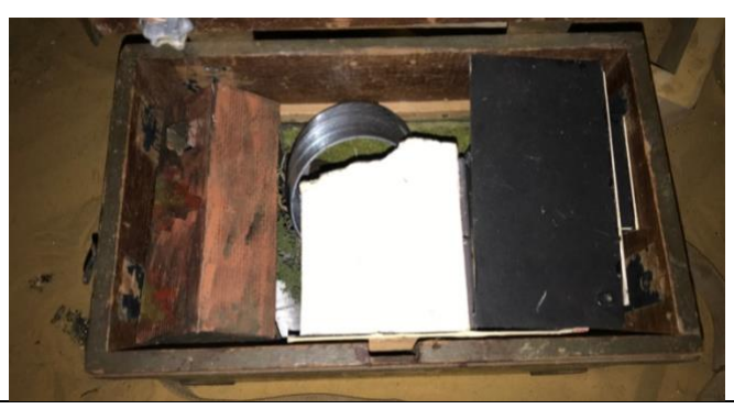
10. Models in gaps in the elastic on the lid (Scene 2) (Scene 4) Burnt woman, burnt boy Soldier with rifle

9. Slinky in gap above trees. Ensuring lid can still fit