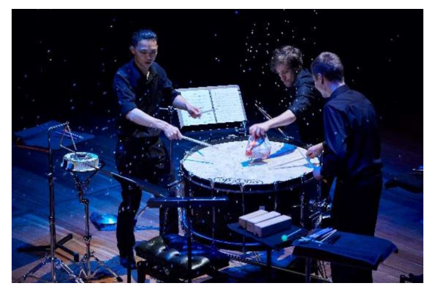
Guildhall percussionists

Income raised through the Trust has enabled a variety of artistic projects, directly supporting Guildhall School's students: