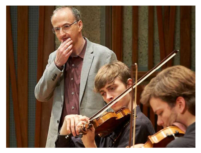
Takács Quartet masterclass

This support is already bearing fruit, with several student groups selected to perform at international festivals and at cultural exchanges at the Liszt Academy, Budapest and Salzburg Mozarteum.