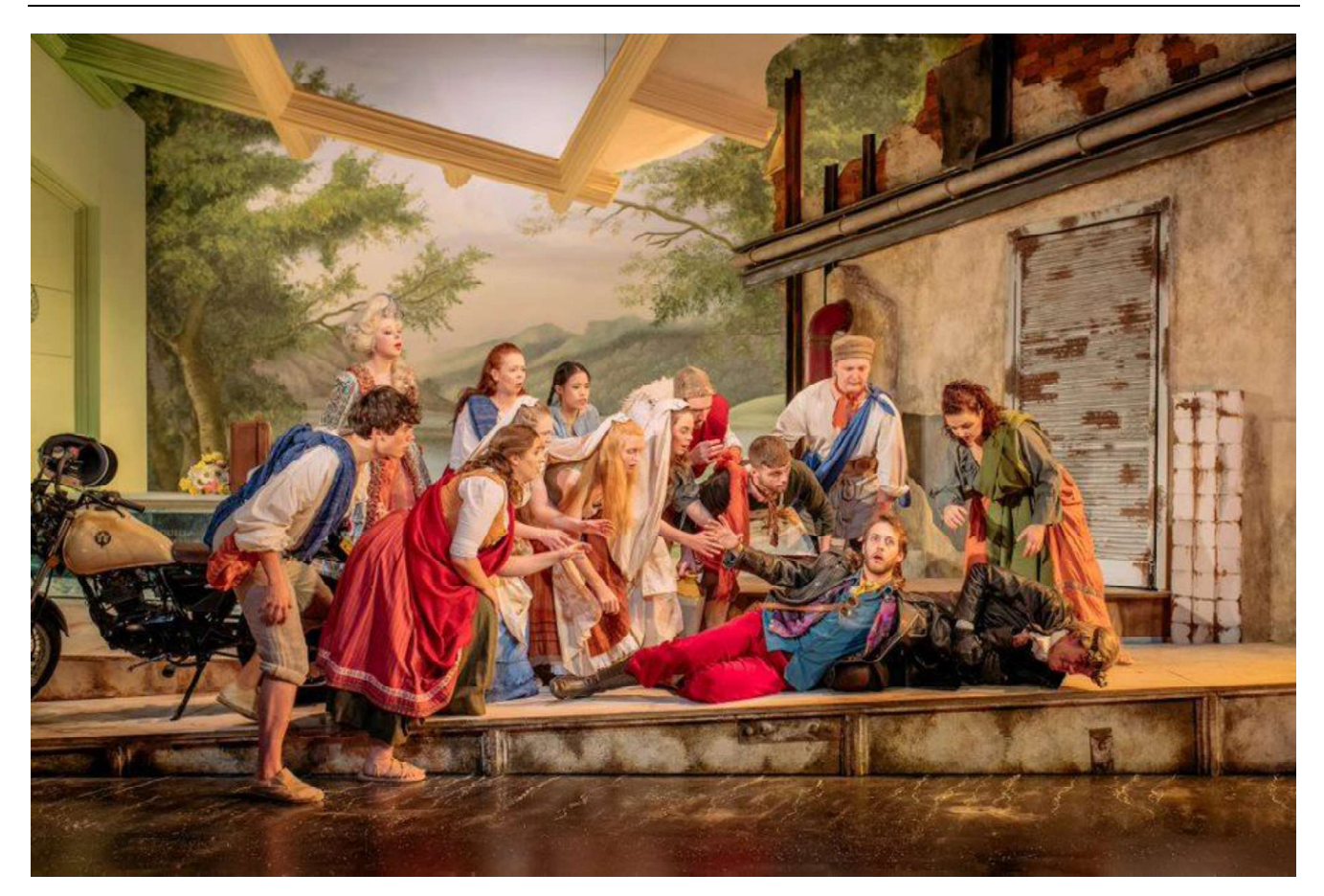
La Fedelta Premiata, Nov 2019