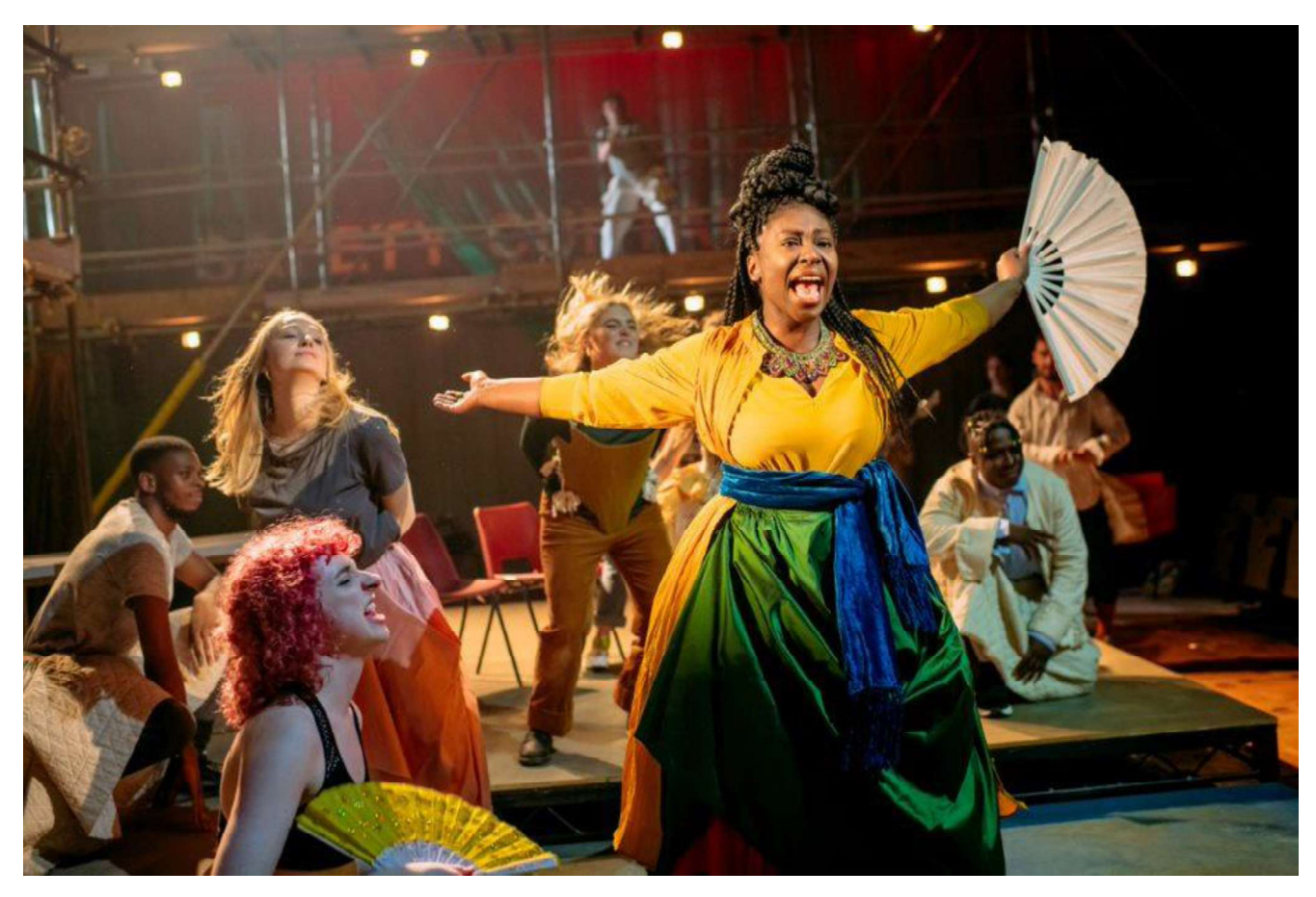
Provok'd: A Restoration, Nov 2019

The Trust is immensely grateful to all its donors, including individuals, liveries, companies and trusts whose support has made such a difference to the lives of students, staff and to the delivery of educational programmes at the School. This year donations have helped students to stay in training and support themselves during the COVID-19 pandemic, alongside empowering them to realise their full potential, enriching the lives of others and leading cultural change.