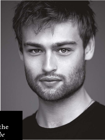
Douglas Booth Actor, known for playing the role of Harry Villiers in The Riot Club and Nikki Sixx in the Netflix film The Dirt .